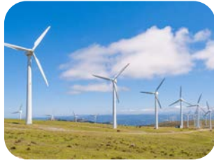
MEDIUM VOLTAGE CABLES