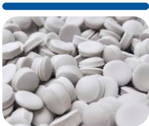
LOW VOLTAGE INSULATION COMPOUNDS